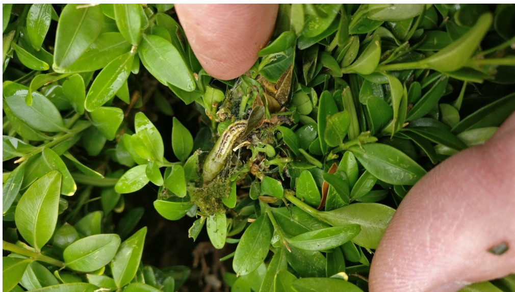
Pupa transforming to moth

The European Boxwood & Topiary Society - www.ebts.org has lots of interesting information.